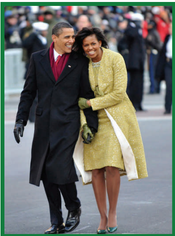
The coat was made of wool lace in a silk net, with silk underneath and a layer of pashmina for warmth.

At the inaugural ball, Mrs. Obama wore a white chiffon, one shoulder ball gown. She certainly dressed to impress! The First Lady shined as she waltzed the first dance with President